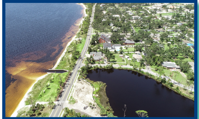
East Caroline Boulevard