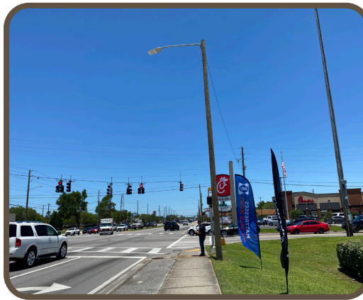
Beal Parkway at Lewis Street