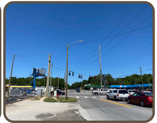
Beal Parkway at Pelham Road