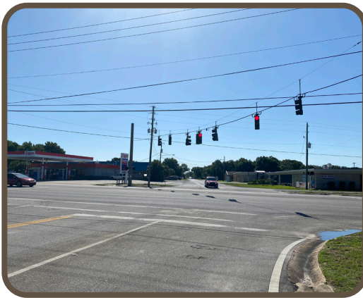
Eglin Parkway at Erwin Fleet Road